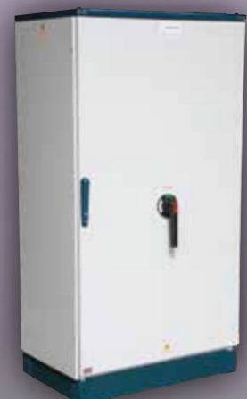
* 1600A+ come in floor standing enclosures