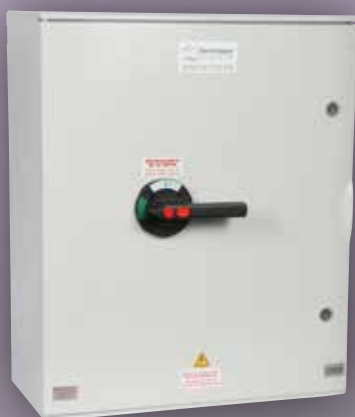
GRP enclosures are available in a variety of sizes